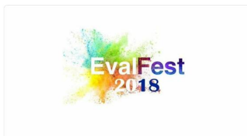
EvalFest 2018: Visibility, Voice, and Value EvalFest 2018 Day 1, 7 February 2018 A consultation o... eventbrite.com

Thank you @cmsadvocacy for an excellent session on "Ethical Standards in Social Research and #Evaluation: Indian and International Perspective and Practices" on at CMS Saket as part of #Evalfest18 @pnvcms We find partnership with CMS very valuable @alokanuj @FeministEval