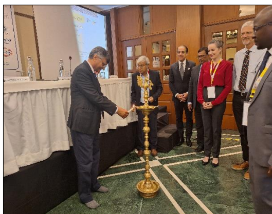
Inauguration Ceremony, 21 February 2024