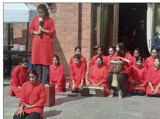
Street play by Aakar Street Play Society, Lady Irwin College, 23 February 2024