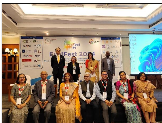
Closing Ceremony, 23 February 2024