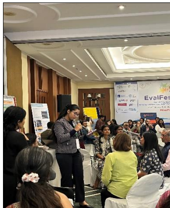
Innovation Bazar, 23 February 2023