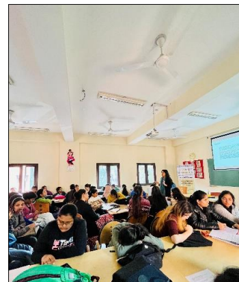
Glimpses of Satellite Sessions held at Lady Irwin College during EvalFest 2024, 19-20 February 2024